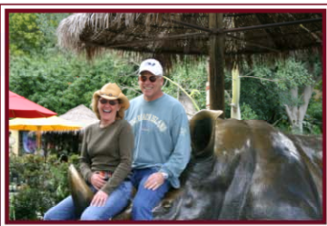
Hia and Boon, unable to find a lion settled for a seat on a Rhino.

As expected the 361 Club team won by a large margin, easily beating the point spread. The team celebrated the following evening by consuming the free dinner and drinks that comprised the first prize.