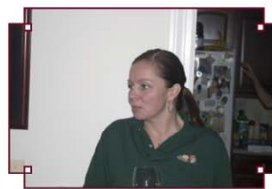
Newest Official Member