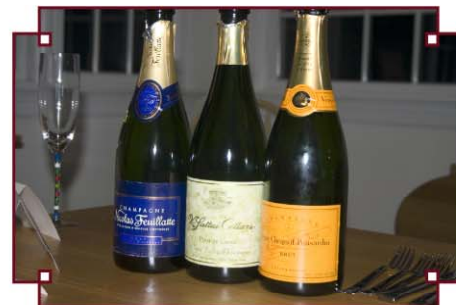
The contenders joined by an old favorite - "The Widow".

In a break with tradition the votes of the friggin guests were officially counted in the tasting. Results: