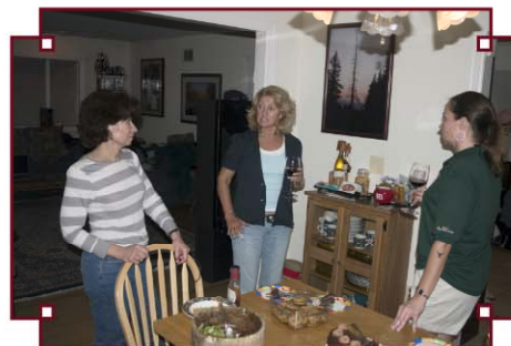
The female club members, Calamity, Hia, and Kit trying to figure out why the male members of the club suck.