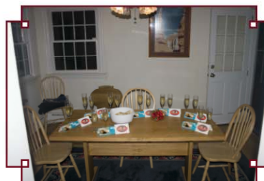
The arena with a plethora of place cards.