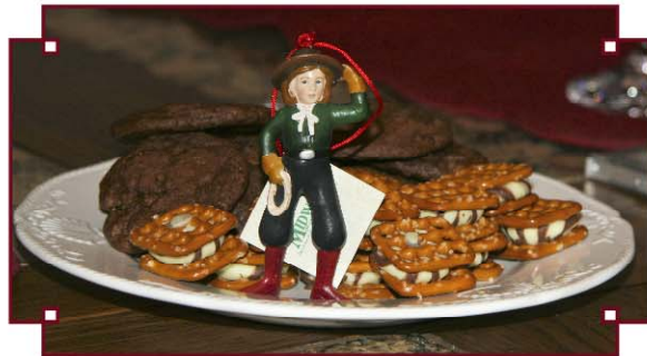
More dessert in the form of cookies and pretzels guarded by a small version of Calamity "Friggin" Jane.