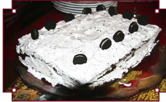
The usual healthy dessert.