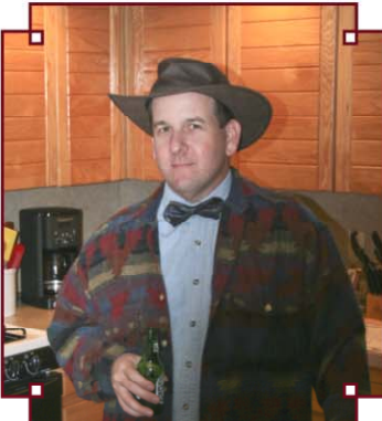
Poncho, looking sporty, in a rare non-profile shot.