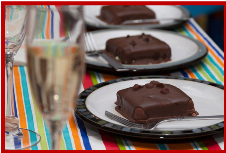
...and Dessert Shrapnel