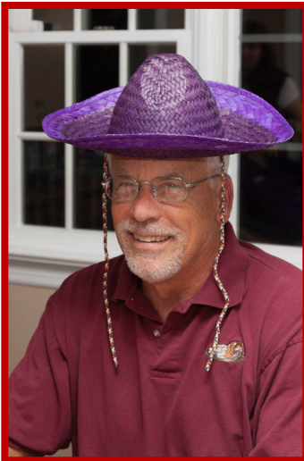
Boon "Friggin" Doggle