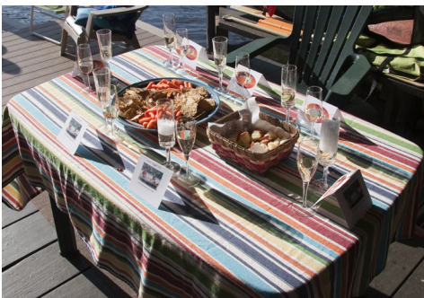
The wine is poured

Judging by the enthusiasm shown by the tasters the lake is a great place to drink (our research has shown that this is a trait shared by many locations).