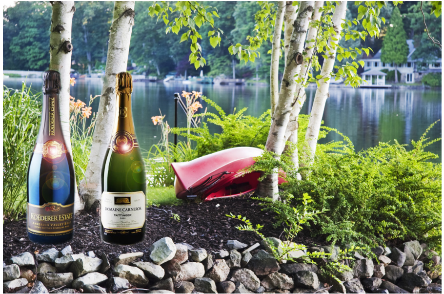
The contenders by the lake