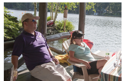
Pancho and Kit (and cub)