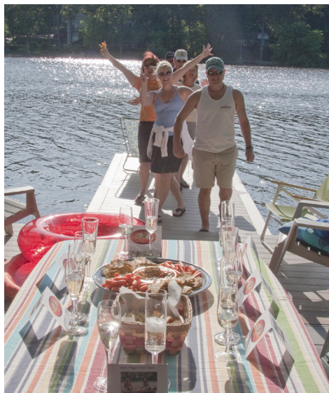
And nobody fell in

Judging by the enthusiasm shown by the tasters the lake is a great place to drink (our research has shown that this is a trait shared by many locations).