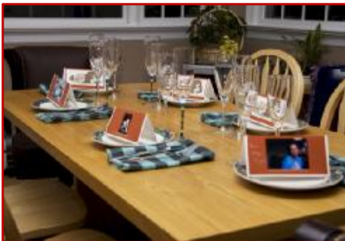
The arena prior to festivities