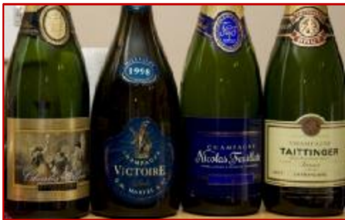
The contenders and friends