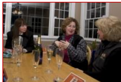
Kit, Friggin Guest and Hia contemplating the future of the universe