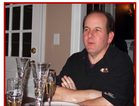
Poncho - relieved

doubtful that the moments he selected will in the judgment of history match the importance of The 361 Club meeting.