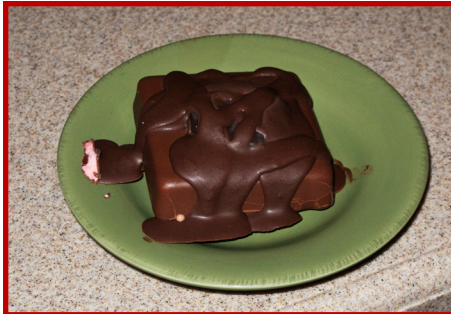
Dessert Shrapnel - armed and dangerous