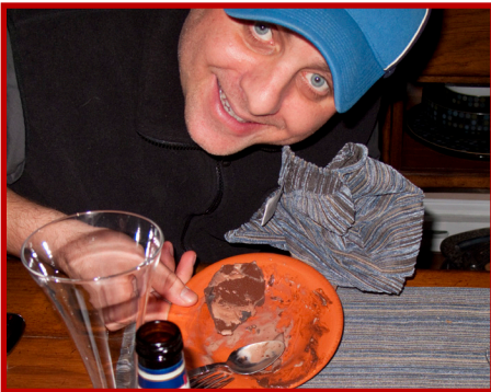
Two Step digs in