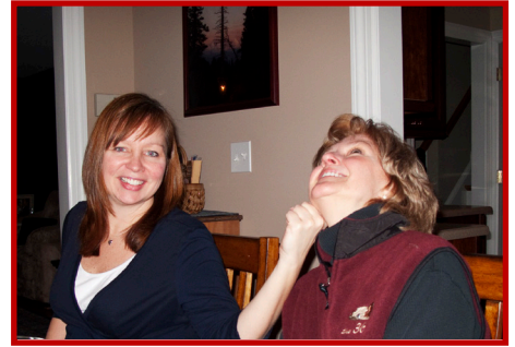
The traditional punch in the jaw

Although Kit has a history of viciously attacking Hia, both parties are having too much fun for this to be considered a serious altercation.