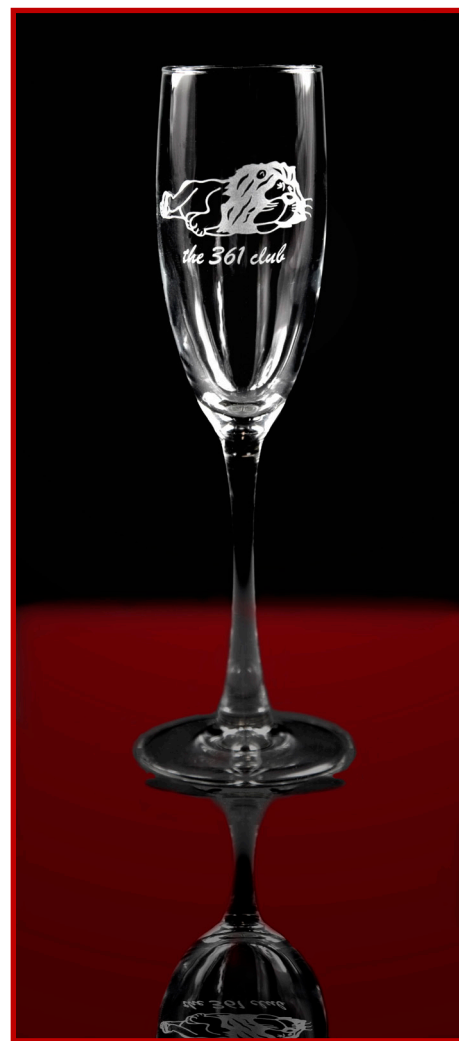
Product of the month

Boon, upset by the loss of "The Widow" in the evening's tasting, was captured on video trying to convince a toy monkey to cast the tying vote. The monkey, although impressed with the vintage, was unwilling to upset the proceedings. The monkey also suggested that Boon may have had enough to drink.