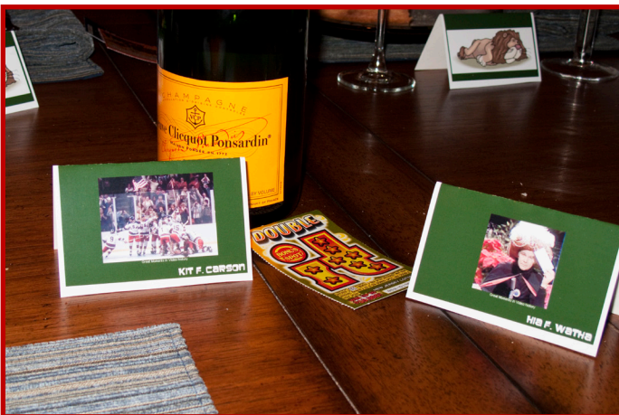
Place cards and assorted stuff