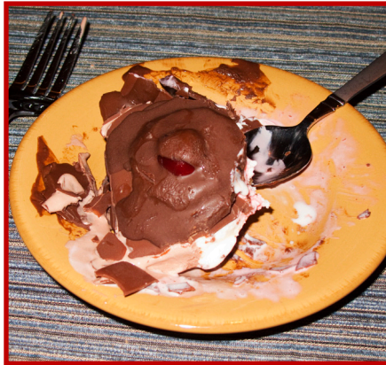
Dessert Shrapnel - defused