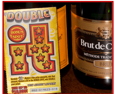
Lottery ticket with tasting winner

Although Kit has a history of viciously attacking Hia, both parties are having too much fun for this to be considered a serious altercation.