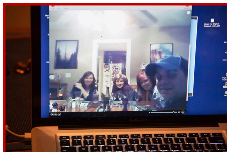
Views from Delaware