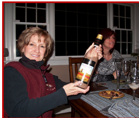
ChocoVin - it seemed like a good idea