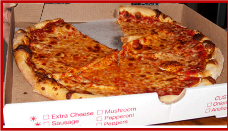
The pizza course