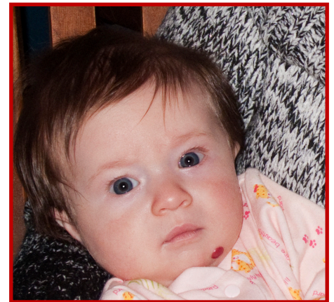
Even prettier all by herself