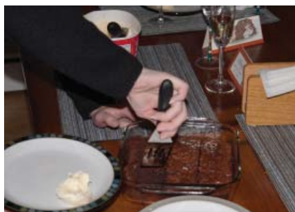
Rich chocolate and ice cream

The club members are unfazed at the prospect of ruining their palates prior to tasting the wine. This picture was taken after the females in attendance had disposed of Poncho and Boon.