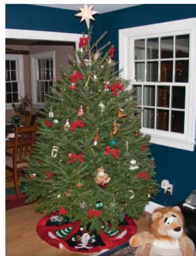
The Merry Christmas lion

Kit and Poncho's new dining room furniture provided a great setting for tasting. Fortunately, there was relatively little damage inflicted during the festivities. The Christmas tree looking beautiful as a backdrop for the ever-present lion (the club's current inanimate mascot).