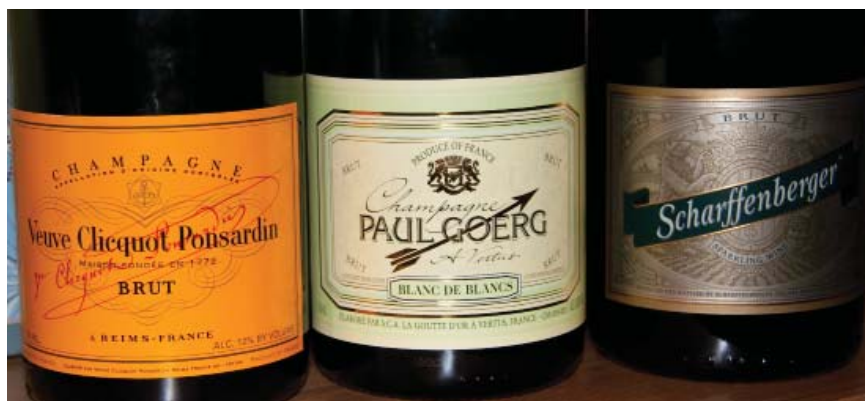
The Widow, always a welcome backup when not a contender

Once again a traditional chocolate dessert was served with a tasty scoop of ice cream. However, the main attraction was Poncho's home made pizza. Unfortunately, the pizza is not shown - Boon was so busy eating it that he forgot to take the picture.