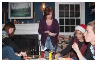
Pre tasting snacks