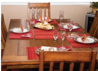
The Arena - Before

The arena, prepared by Kit before the onslaught of the drunken club members. Featured is the new dining room furniture recently acquired by Kit and Poncho.