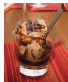
Chocolate of mass destruction