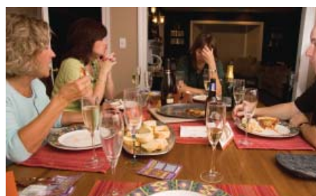
The Arena - After

As the meeting progresses Kit can only wonder how and why she has gotten herself into this mess. The rest of the members seem indifferent to her plight.