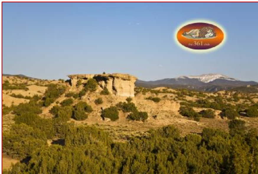
Nice neighborhood for a tasting