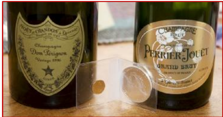
The contenders with valuable coins

Bat went all out in selecting one of the standards by which others are compared, Dom Perignon, and Perrier Jouet holder of the best record in 361 Club competition. In a stunning upset Perrier Jouet once again prevailed. In addition to exhibiting its usual aroma of rotting cabbage the Perrier also delivered its hard to beat taste. Recent upsets indicate that there are a great variety of interesting and quality Champagnes or that club members have drunk so much beer and tequila that they can no longer taste the difference.