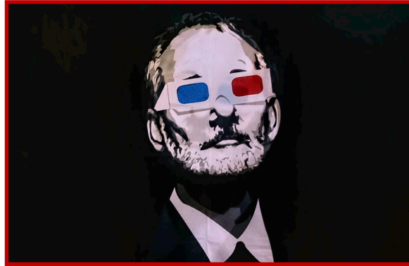
The Patron Saint of??????