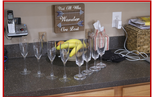
The proper tasting glasses