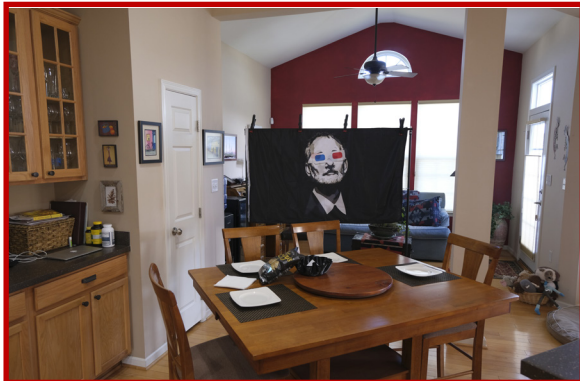
The tasting area