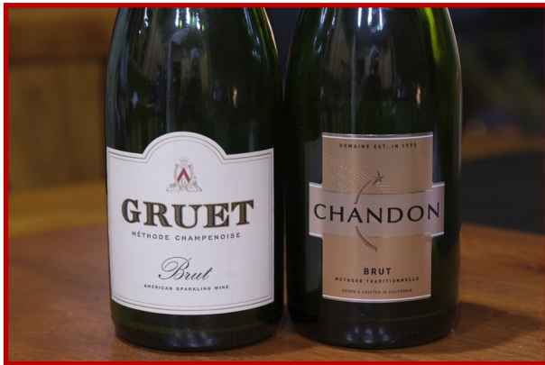
The best of France???