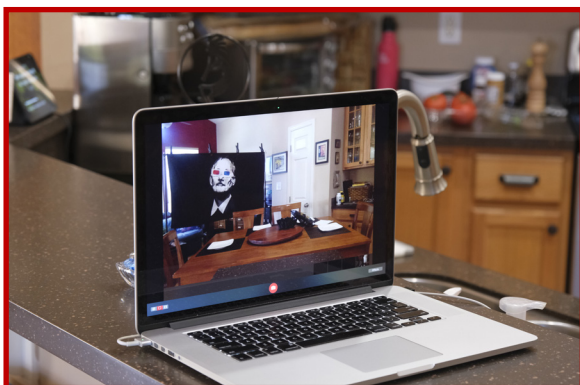
The latest MacBook with running water