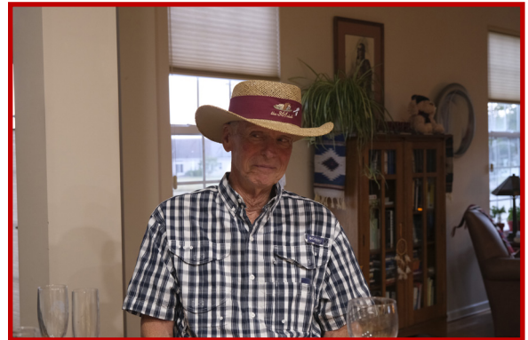
Wearing the uniform