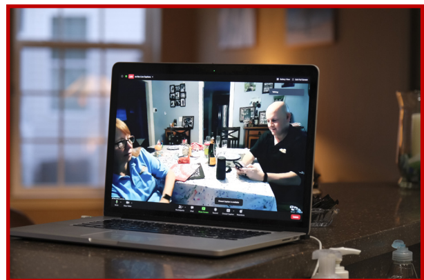
At least it appears to be French

It looks like Kit and Pancho have selected a label much more familiar to traditional tasters. Although it doesn't seem to have any competition it was certainly a fine choice.