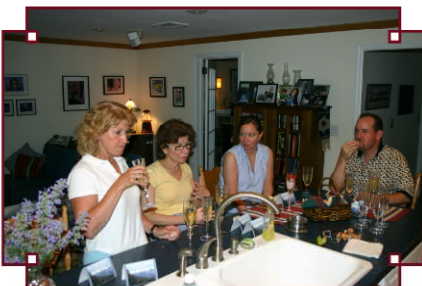
Tasters at work.