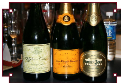
In an effort to further confuse the panel Calamity introduced an unofficial contender - the previously undefeated Perrier Jouet. It was generally agreed that it still tasted pretty good but smelled awful.