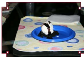
The usual chocolate laden dessert.