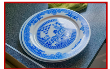
It speaks for itself

See below for the ever cool Calamity Ware.