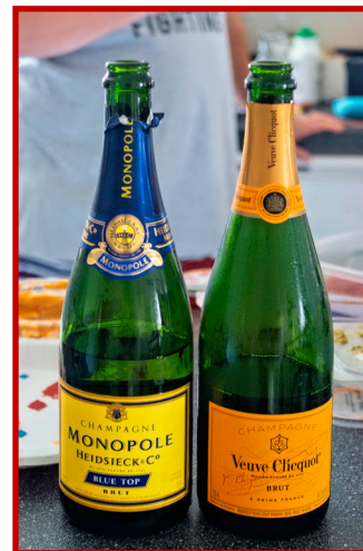
The alcohol course - served throughout the meeting