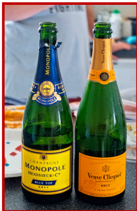
A must win for the Widow