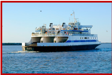
It looks pretty safe