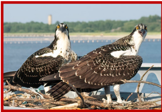
We are glad to see them go