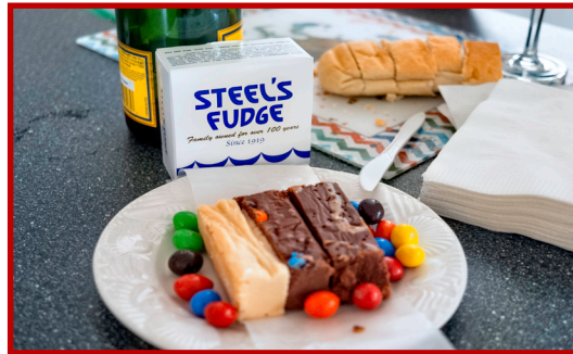
The sugar course

Although the best nutritionists consider sugar, alcohol and caffeine to be the most important food groups the 361 club has replaced caffeine with starch. After all, calories are important too.