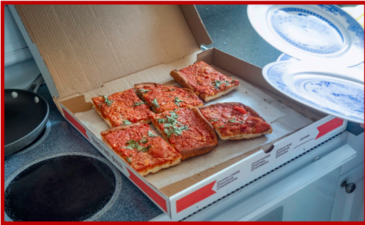
The main course - starch of course

Although the best nutritionists consider sugar, alcohol and caffeine to be the most important food groups the 361 club has replaced caffeine with starch. After all, calories are important too.